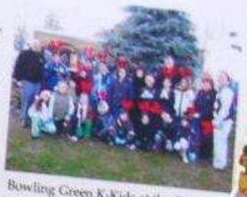
Bowling Green K-Kids at the CASA Holiday Tree Lighting

The Bowling Green K-Kids started their holiday celebrations early with a Day of Holiday Service on Friday, December 12, 2008. Their day began with a toy drive collection for the John Theissen Children's Foundation. This local organization provides holiday presents, birthday parties and wishes for sick and needy children. The school-wide toy drive was conducted in partnership with the Bowling Green Student Council and collected toys for over 50 children.